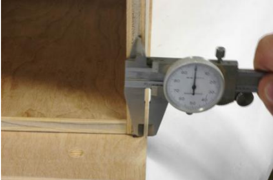
fig G fig H

Use a pencil to trace the layout of the stand onto the base. Remove the stand from the base.